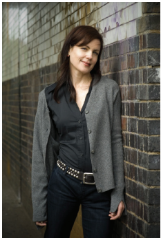
Elizabeth McGovern Countess of Grantham, Cora, Downton Abbey