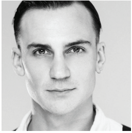
Henry Lloyd-Hughes Ralph Whelan in Indian Summers

Protagonist Ralph Whelan is the mystery man at the heart of Indian Summers : a gifted administrator, man of the people, and ardent lover. Or is he not what he seems? Henry Lloyd-Hughes plays this complicated character with thrilling subtlety. An actor in high demand, Lloyd-Hughes recently finished the heist sequel Now You See Me: The Second Act , in which he appears with the returning cast plus newcomers Daniel Radcliffe and Lizzy Caplan. And he is currently starring as the hapless husband to Mia Wasikowska's Emma Bovary in the movie adaptation of Gustave Flaubert's classic, Madame Bovary . In 2013, he played in the comedy drama Hello Carter , and the previous year he was in Joe Wright's Oscar-winning Anna Karenina , adapted by Tom Stoppard from the Leo Tolstoy epic. Also in 2012, he appeared in the acclaimed mini-series Parade's End , with Benedict Cumberbatch, Rebecca Hall, and Anne-Marie Duff. His other notable movie work includes Weekender , Dimensions , Unrelated , the Welsh BAFTA-winning TV biopic Shirley , about Shirley Bassey, and he played the handsome wizard Roger Davies in Harry Potter and the Goblet of Fire . In the UK, Lloyd-Hughes is indelibly associated with the school bully Mark Donovan from the 2008-2010 hit comedy series The Inbetweeners . No one ever forgets a bully!