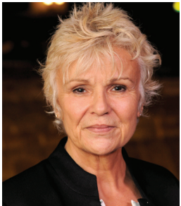
Julie Walters Cynthia Coffin in Indian Summers