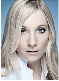
Joanne Froggatt Anna Bates, Downton Abbey

Golden Globe® winner and three time Emmy® award nominee (currently nominated for Season 5)