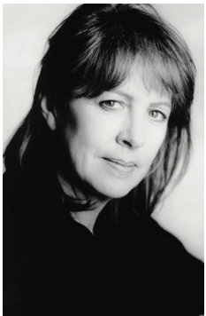
Penelope Wilton Isobel Crawley, Downton Abbey