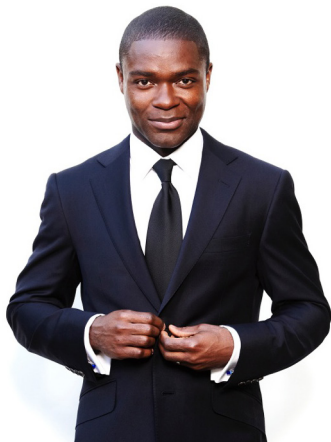
David Oyelowo Javert and co-executive producer, Les Misérables

well as starring roles in To the Bone ; Love, Rosie ; The Mortal Instruments ; and on television, the Amazon series The Last Tycoon . Upcoming, she will star with Zac Efron and John Malkovich in the Ted Bundy biopic thriller Extremely Wicked, Shockingly Evil and Vile , and she will play the wife and muse of J. R. R. Tolkien in the biopic Tolkien .