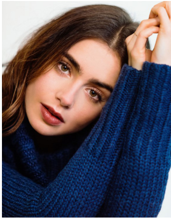
Lily Collins Fantine, Les Misérables

For her role as Fantine in MASTERPIECE’s epic retelling of Les Misérables , Lily Collins had the challenge of portraying her character’s entire adult life, from her carefree first love to her harrowing final days—something only the luxury of a six-hour adaptation allows. Speaking of Fantine’s heart-wrenching decline, Collins says, “I personally as an actor have never gone that low ... it was a really powerful experience for me to let go and give it all up to the moment.” Collins faced a different kind of challenge in Warren Beatty’s 2016 comedy-drama-romance Rules Don’t Apply , in which she played an aspiring actress mixed up in Howard Hughes’ show business aspirations. In that film, her portrayal of a religiously devout ingénue in 1950s Hollywood earned her a Golden Globe® nomination. Collins’ other film roles include Snow White in the fantasy-adventure Mirror Mirror with Julia Roberts, as